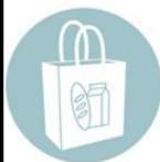
High capacity bags

Go to www.mcfallfuel.co.nz for more information on Gather Bags