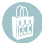
Six bottle carrier