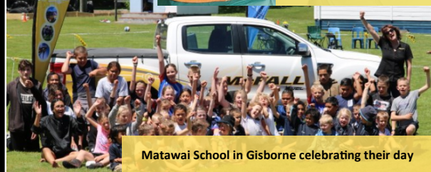
Matawai School in Gisborne celebrating their day