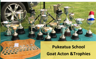
Pukeatua School Goat Acton & Trophies