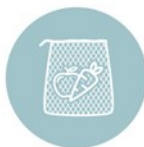
Mesh produce bags