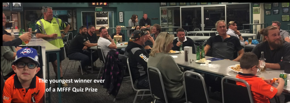
The youngest winner ever of a MFFF Quiz Prize