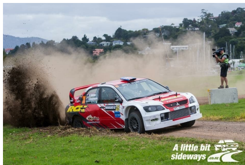
A little bit sideways